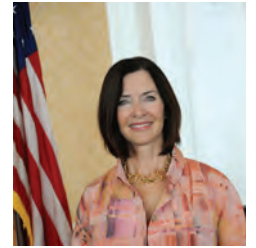
Victoria Street President

The Occupy Wall Street movement was started by Adbusters , the Canadian anti-corporate magazine based in Vancouver, British Columbia, that asked young people the ultimate question: "What is our one demand?"