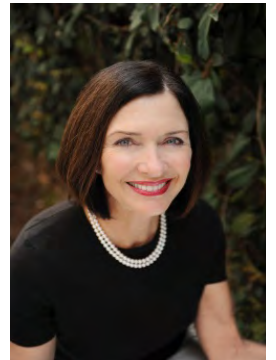
Victoria Street, President

Pretty simple, really. It's what we do with our gifts that count.