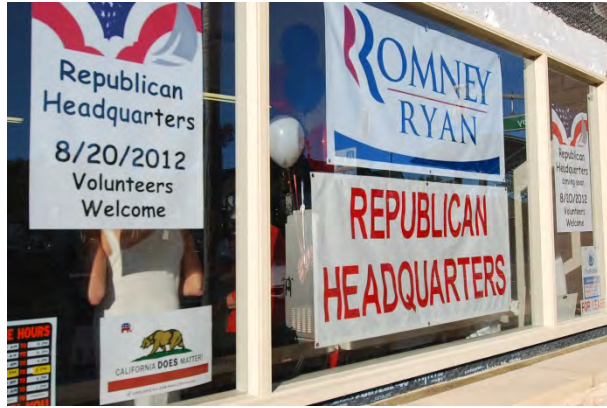
Our Headquarters at 3734 E. Coast Hwy. CDM